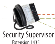
Security Supervisor Extension 1435